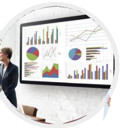
86 inches 30 m 2 (20-30 people)