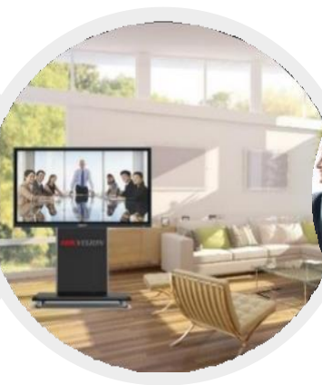
75 inches 20 m 2 (10-20 people)