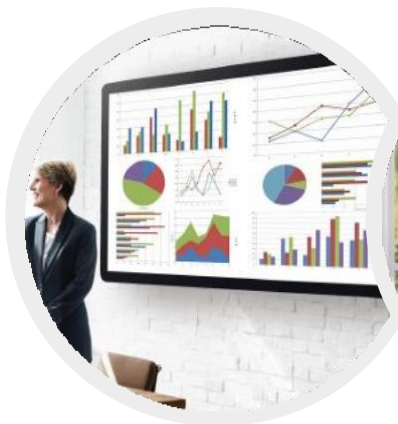
65 inches 10 m 2 (2-10 people)

Product choices should be made based on the size and layout of the meeting room, and the number of attendees.